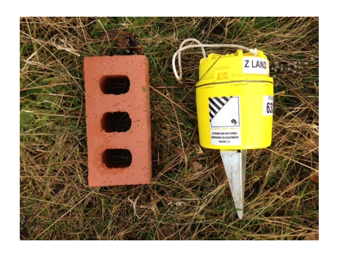
Node scaled with house brick

Signals generated as part of the survey are received and recorded by a network spread of self-contained sensitive microphones called Nodes (below and right).