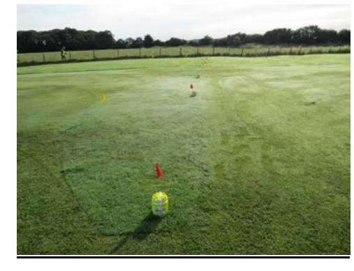
Nodes in situ (Golf Course)

The Nodes will be planted at regular intervals along each survey route. There may also be a small spread of geophones and cables nearby, which will be connected to a main recording cable through which geophysical data will be transmitted to a small stationary control vehicle. The survey is transient and will be seen to migrate from one side of the prospect to the other as the survey progresses. Neither the surveying equipment used nor the vibrations produced pose any risk to property, public safety or health. During the period of the survey a private security team will be observing our equipment to deter vandalism or theft. If you have any concerns please contact us on the listed numbers.