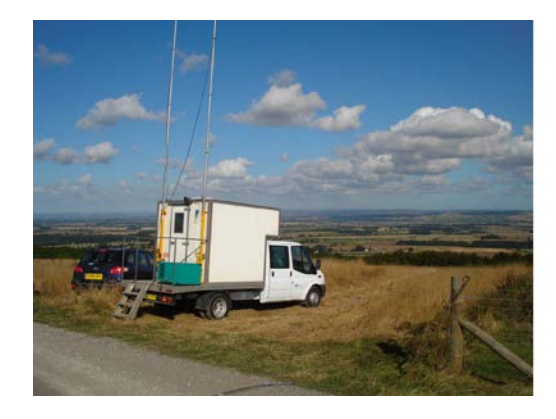
Recording truck with radio antenna